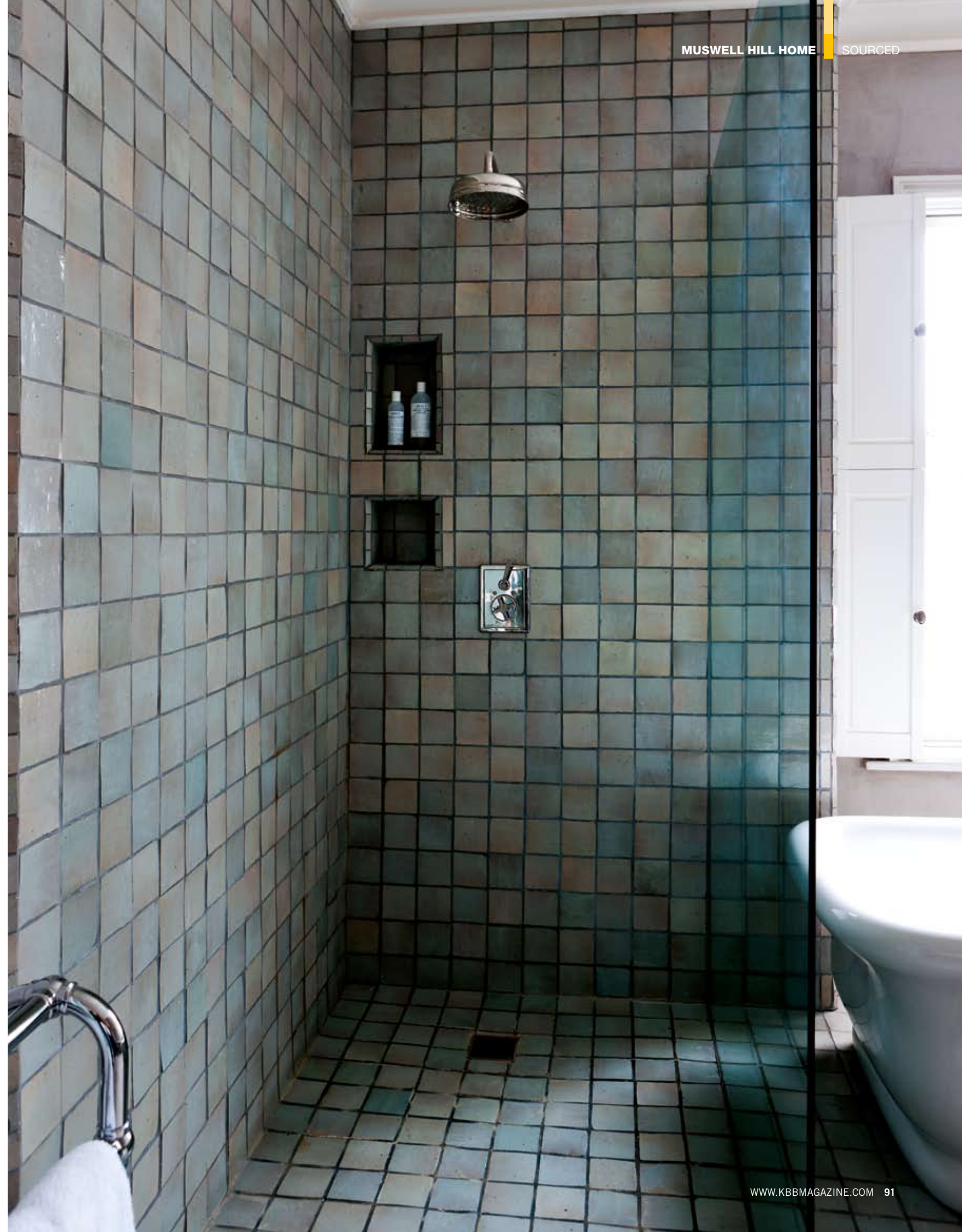
Opposite page: A large walk-in shower clad in striking iridescent tiles from Fez is evocative of the Moroccan hammam.