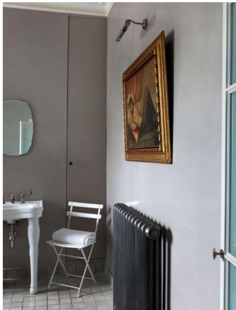
Above: A white chair from The Conran Shop and classical-style painting ensure the focus remains on beauty and relaxation rather than functionality.