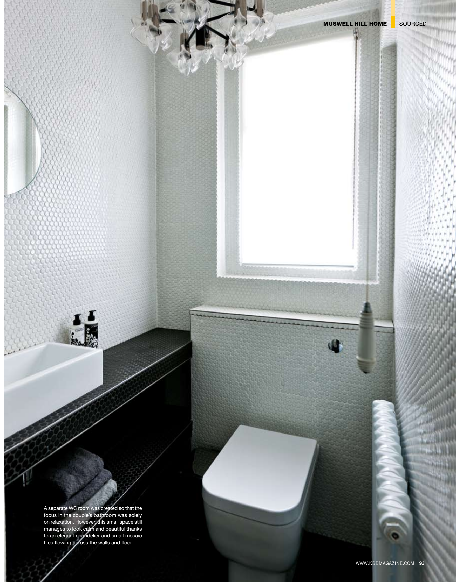
A separate WC room was created so that the focus in the couple's bathroom was solely on relaxation. However, this small space still manages to look calm and beautiful thanks to an elegant chandelier and small mosaic tiles flowing across the walls and floor.